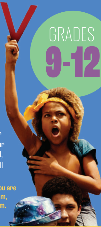
Youth v. Gov

Consider this documentary film if you are exploring the topics of youth activism, climate change, or the judicial system.